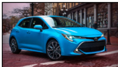
Toyota Corolla Hatchback